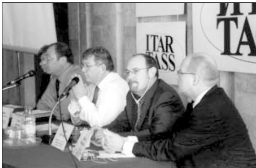
The participants decided to establish a Special Group of experts to elaborate a National Plan of Actions aimed at ensuring multisectoral approach for violence prevention and improvement of services provided to the victims of violence

The conference adopted the resolution where said that Russian society sustains enormous losses due to the