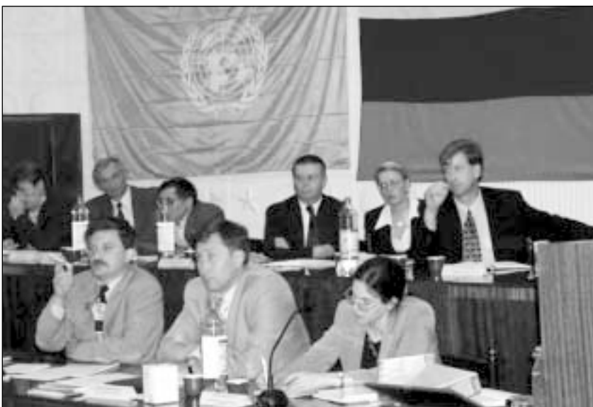
The 3rd meeting of the Steering Committee for the UNDP/GEF Project “Demonstrating sustainable conservation of biological diversity in four protected areas of Russia’s Kamchatka Oblast”

After reviewing result to date, the Steering Committee meeting approved and adopted the project workplan for the year 2004. The focus will be on improving the quality and promoting the sustainable use of the landscape and values associated with it, and the development of replicable models for ecotourism, and to develop the capacity for alternative livelihoods for local residents in protected and adjacent areas.