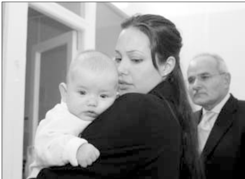
In Moscow, Angelina Jolie paid a visit to the Morozov children's hospital and donated $20,000 to the hospital.

UNHCR has launched a three-year integration programme to improve the situation of 7,000 refugees in North Ossetia who are living in ap-