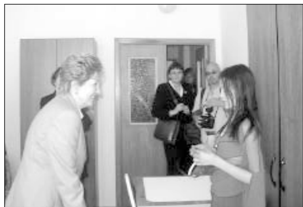
Vice Premier of the Government of the Russian Federation Galina Karelova during her visit to the Kvartal centre