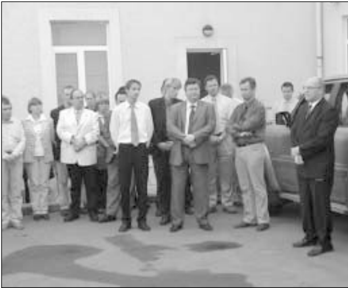
Staff of UN Country Team in the Russian Federation: UNFPA, UNDP, UNODC and WHO observes the minute of silence in memory of the victims