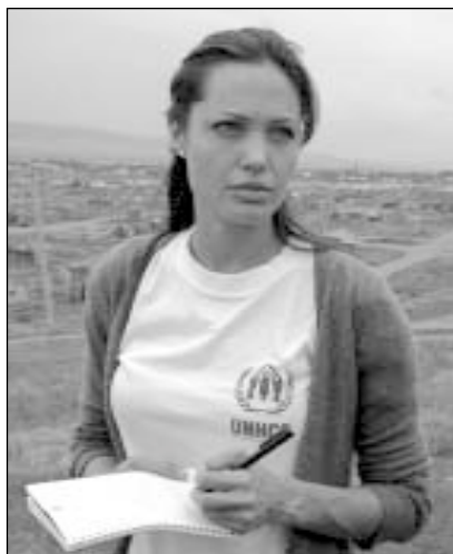
Jolie at Bella tented camp, which houses some 1,000 displaced Chechens

On August 25, the UN refugee agency's Goodwill Ambassador, Angelina Jolie, has concluded her four-day mission to the Russian Federation by calling for all options to be kept open for displaced Chechens who do not wish to return to Chechnya at this stage.