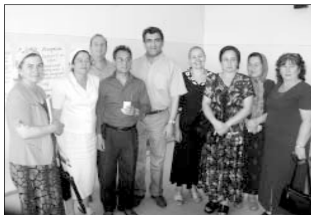
Participants of WFP Workshop on School Feeding Programme in Chechnya. May 2003, Nazran, Ingushetia

trict of Chechnya. Caritas Internationalis (Czech Republic) provides hot meals to several day care children centres and kindergartens in Grozny within the framework of school feeding programme. Saudi Red Crescent Society (Saudi Arabia) delivers WFP monthly food rations to IDPs in Satsita camp, Ingushetia. A local NGO, "Vesta", has been responsible for monitoring WFP relief distribution, school feeding and food-for-work activities in Chechnya since 2001.