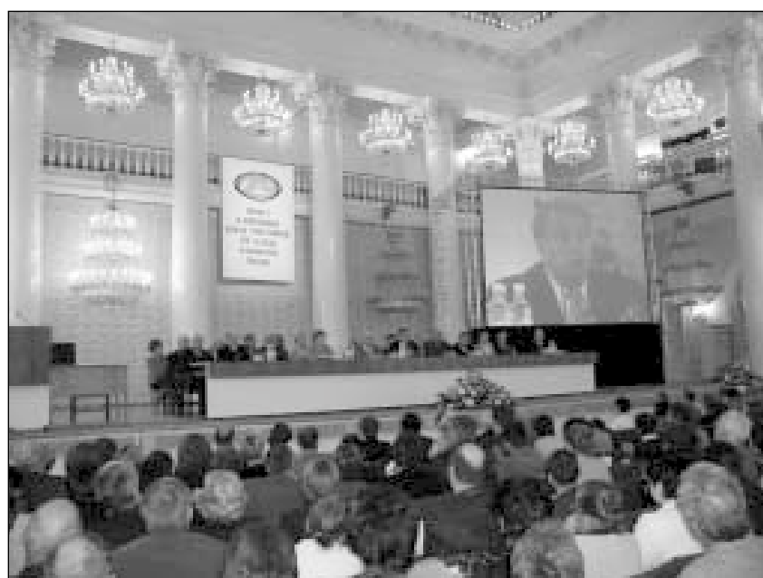
More than 1,000 delegates of the VIIth Russian Congress of Phthisiatrists appeal to all citizens of Russia to unite the efforts for TB Control

The Congress appeals to all citizens of Russia, legislative, executive authorities and local self-government, medical workers of all specialties, public organizations and mass media to unite the efforts for TB Control – for the welfare of Russian people and all mankind.