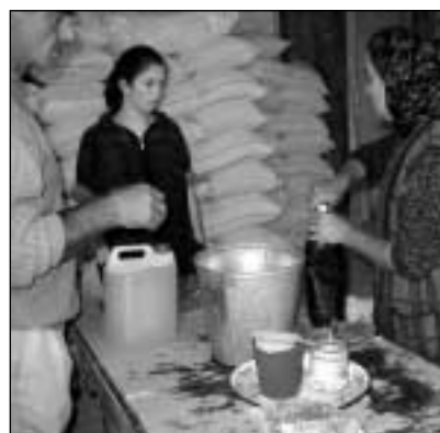
NGO implementing partners distribute food aid from WFP

For the future, I would like to be able to continue this work and I would call on the donors and humanitarian organizations such as UN, UNHCR, UNICEF and others not to forget about us as health problems remain, and people need medicines provided to them free of charge, they need food and other forms of humanitarian assistance. We are hoping that they will be aware of our problems and remember us”.