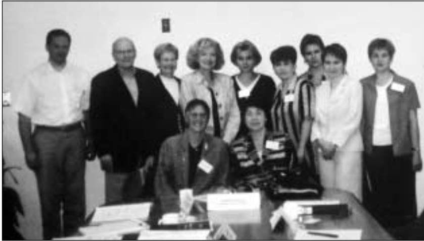
British Columbia and Chuvash Deputy Ministers of Health, other members of the Study Tour and Canadian guests met at the Ministry of Health in Victoria BC

In July 2003, a group of senior Russian health care managers visited Western Canada as part of the WHO/Canadian International Development Agency Programme – Health Care Policy and Stewardship in Russia. Five of the participants were from the Chuvash Republic and one represented the Russian Federation Ministry of Health. The Chuvash Republic is in the process of comprehensive health care restructuring and is one of two pilot regions in Russia participating in the World Bank Health Care Reform Loan Programme in Russia. CIDA has been supporting the Chuvash Ministry of Health with Canadian experts to assist in the development of their Strategic Plan for Health Restructuring and the Study Tour was part of initiatives to familiarize the participants with health care organization and issues in Canada.