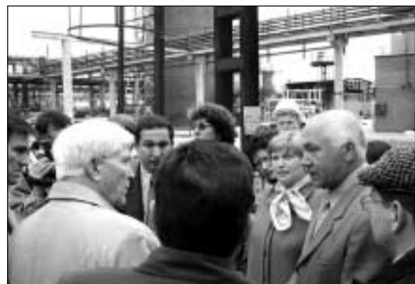
The participants of the Conference in Ufa visit the oil-refinery “Salavatnefteorgsintez”

It was unanimously agreed that broadening and deepening collaboration with WHO is important in solving complex questions of occupational and workplace health. For instance, Russia should urgently eliminate the practice of “hazard pay”, whereby workers are financially compensated for working in dangerous circumstances which destroy their health. Instead, the risk must be eliminated and work made safe. This is how in the West work accidents, occupational and work related diseases were brought down. In Russia they are still many times more common and hence urgent action is needed.