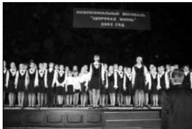
Youth choir from Vologda