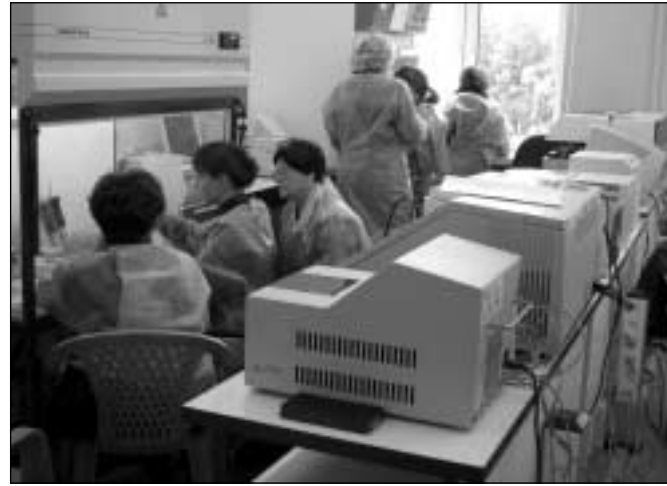
The participants of the First European Training Course on Laboratory Diagnosis on SARS in Moscow

Within this context it is crucial to have a laboratory network in place, which