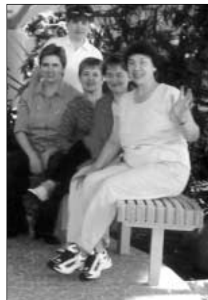
Members of the Study Tour enjoy the atrium of the community hospital in Port Alberni BC